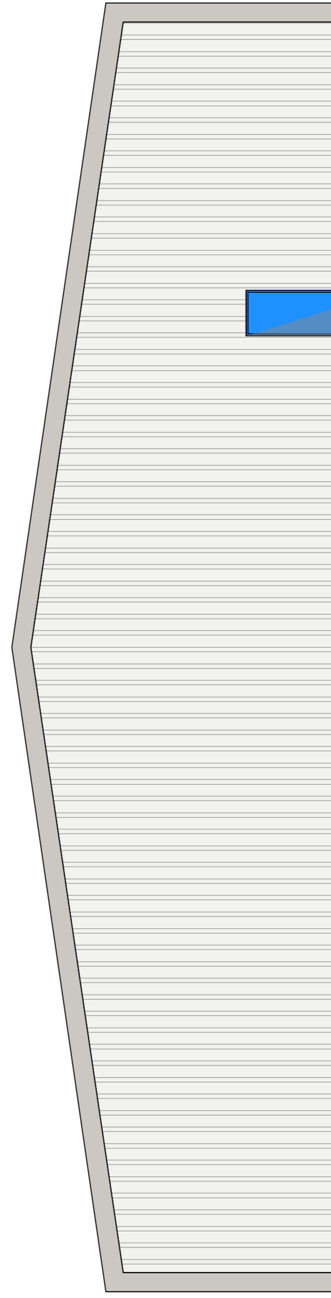
Proposed New Side Elevation