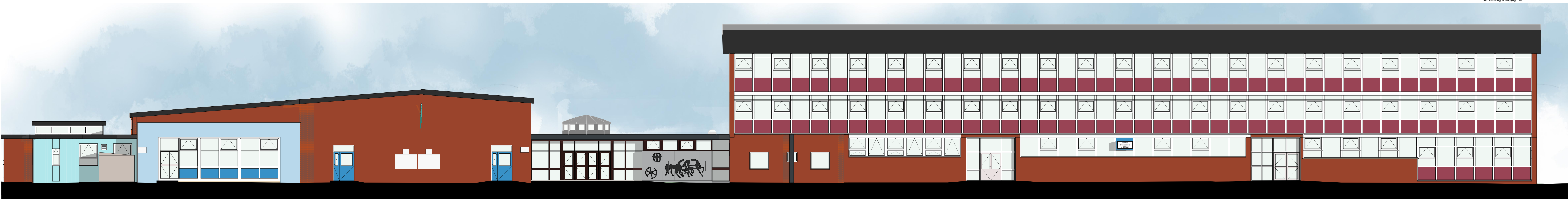
A1 A - Main Building - NW Front Elevation 1:100