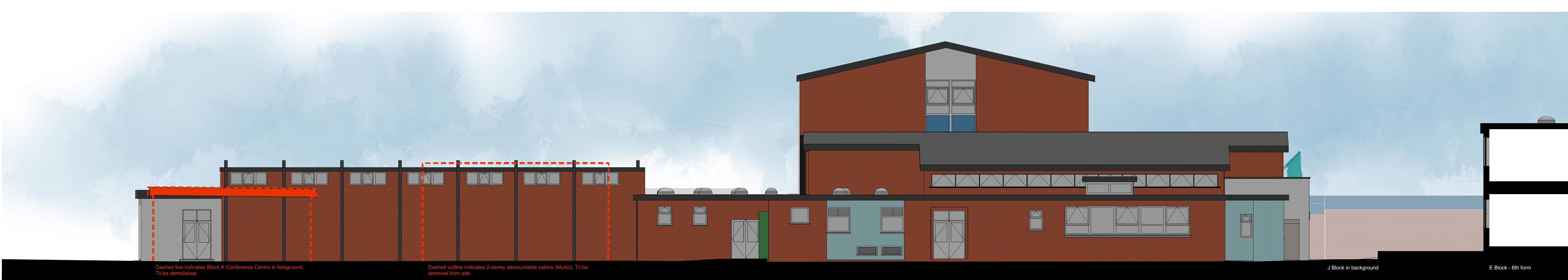
A4 A - Main Building - NE End Elevation 1:100