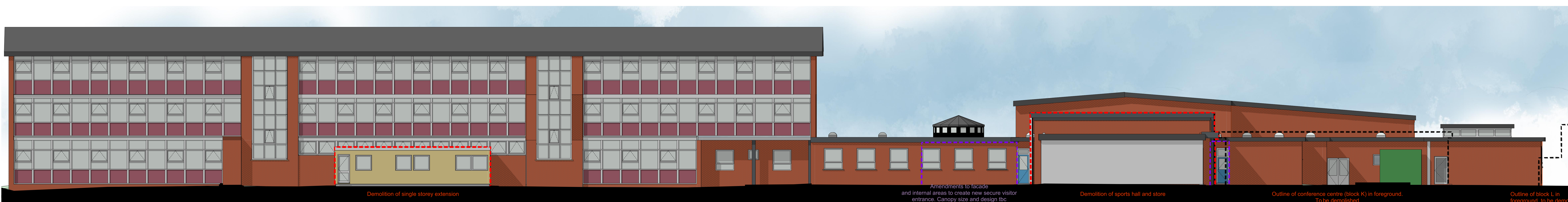
A3 A - Main Building - SE Rear Elevation 1:100