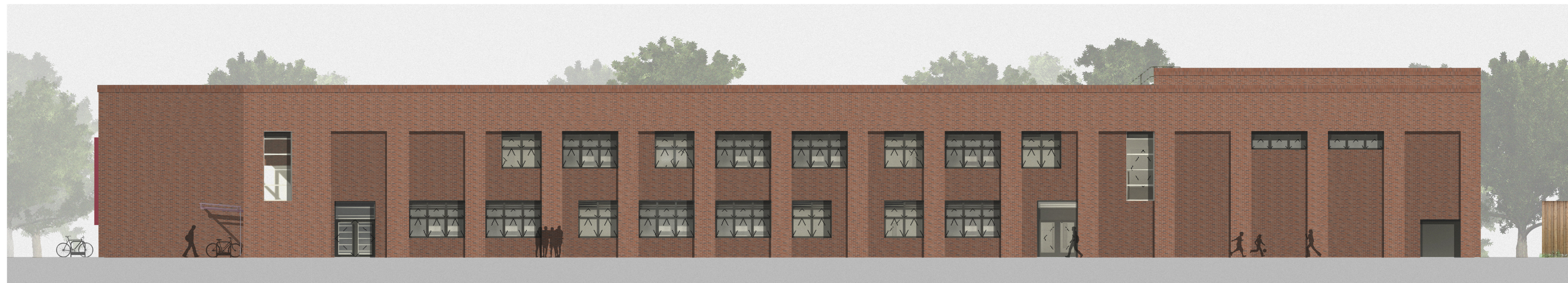
0002 Elevation Colour Scale: 1 : 100