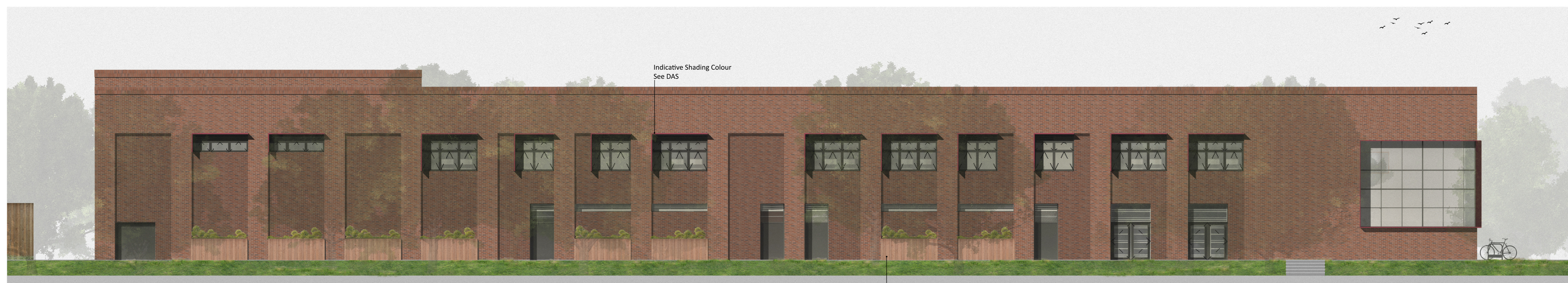
0004 Elevation Colour Scale: 1 : 100

NOTES Check all dimensions on site. Do not scale from this drawing. Report any discrepancies and omissions to HLM Architects. This Drawing is Copyright © DESIGN/SKETCH DESIGN Unless stated otherwise, the designs shown are subject to detailed site survey, investigations, and legal definition, the CDM Regulations, and the comments and/or approval of the relevant Local Authority Officers, Statutory Undertakers, Fire Officers, Engineers and the like. They are copyright, project specific and confidential and no part is to be used or copied in any way without the express prior consent of HLM Architects. PHOTOCOPIED/SCANNED INFORMATION NB This drawing is based on photocopied / scanned information liable to distortion in scale. AREA CALCULATIONS NB The areas shown are approximate only and have been measured off preliminary drawings as the likely areas at the current state of design using the standard option from the Code of Measuring Practice, 4th edition. RICS/JISVA. These may be affected by future design development and construction tolerances, or the result of surveys for existing buildings. Take account of these factors before planning any financial or property development purpose or strategy and seek confirmation of latest areas before decision making. 3RD-PARTY INFORMATION NB This drawing includes information provided by independent surveys and/or consultants, to whom all queries shall be made. HLM Architects can accept no liability for its content or accuracy.