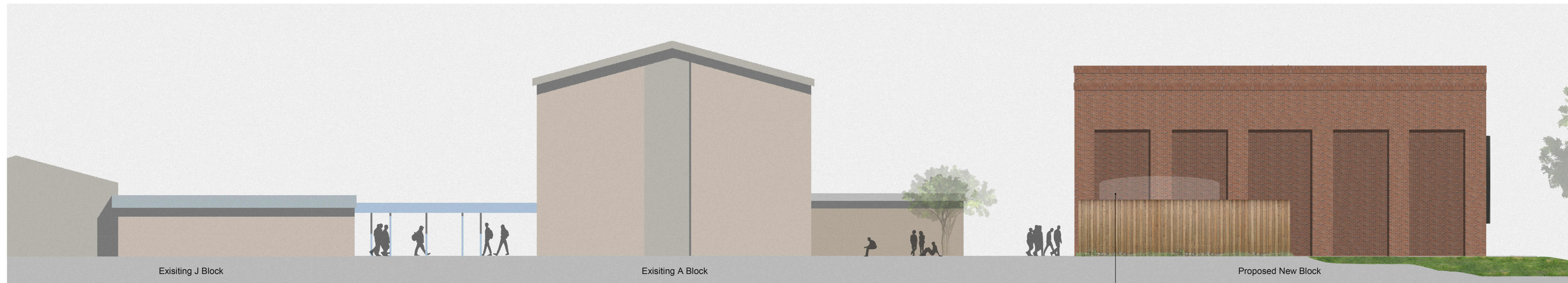
0003 Elevation Colour Scale: 1 : 100