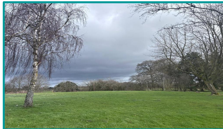
Figure 2: Image of the existing Site