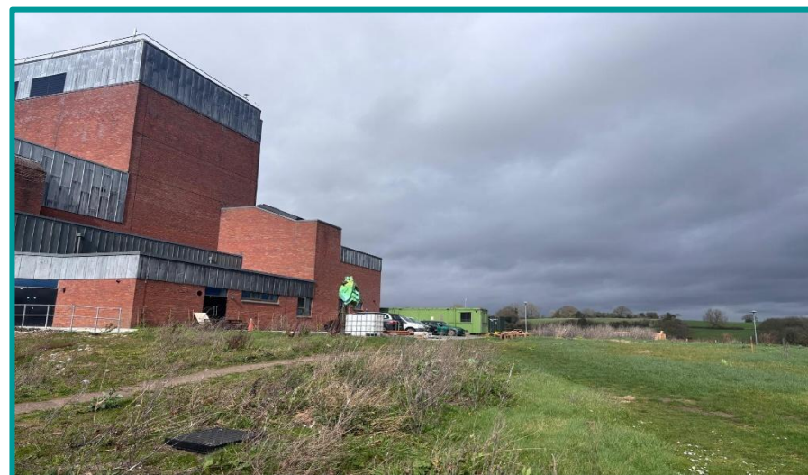
Figure 3: Location of the Site adjacent to Theatr Clwyd