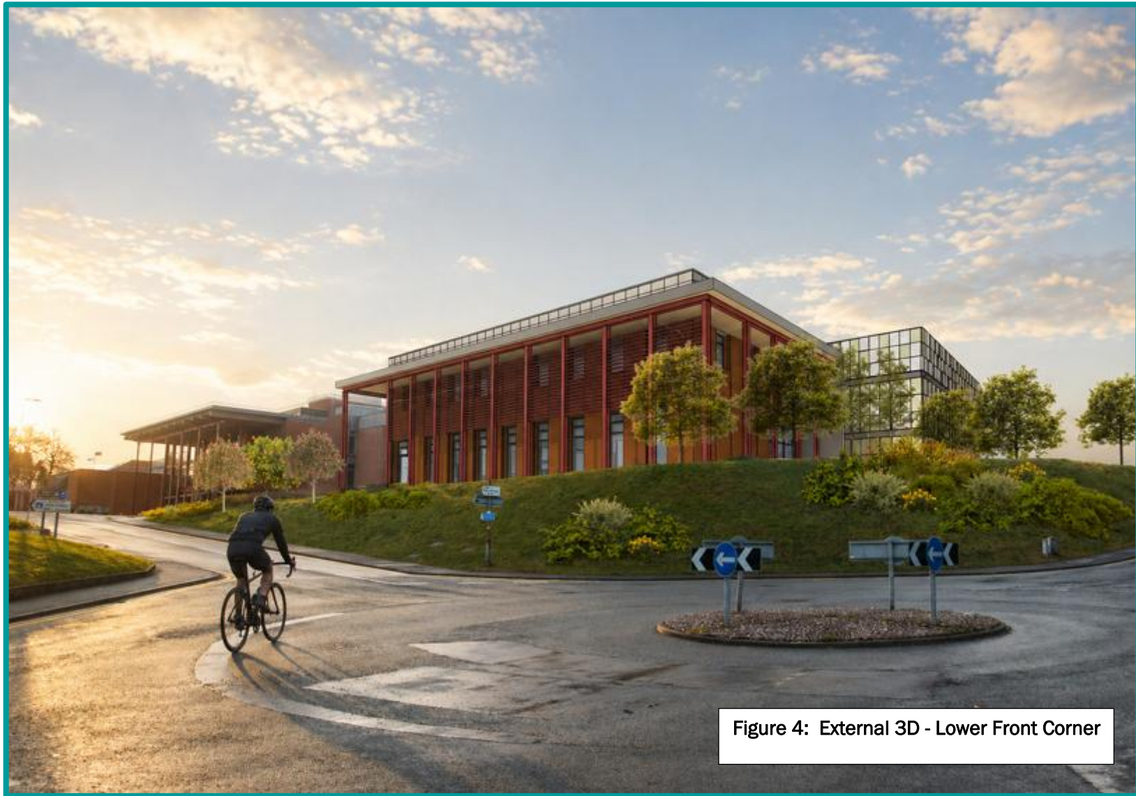
Figure 4: External 3D - Lower Front Corner