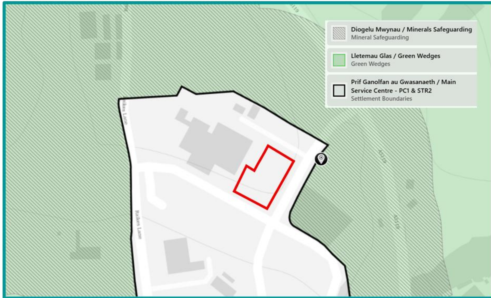
Figure 5: Extract of the Flintshire County Council Local Development Plan (LDP) Proposal Map (Site in red)