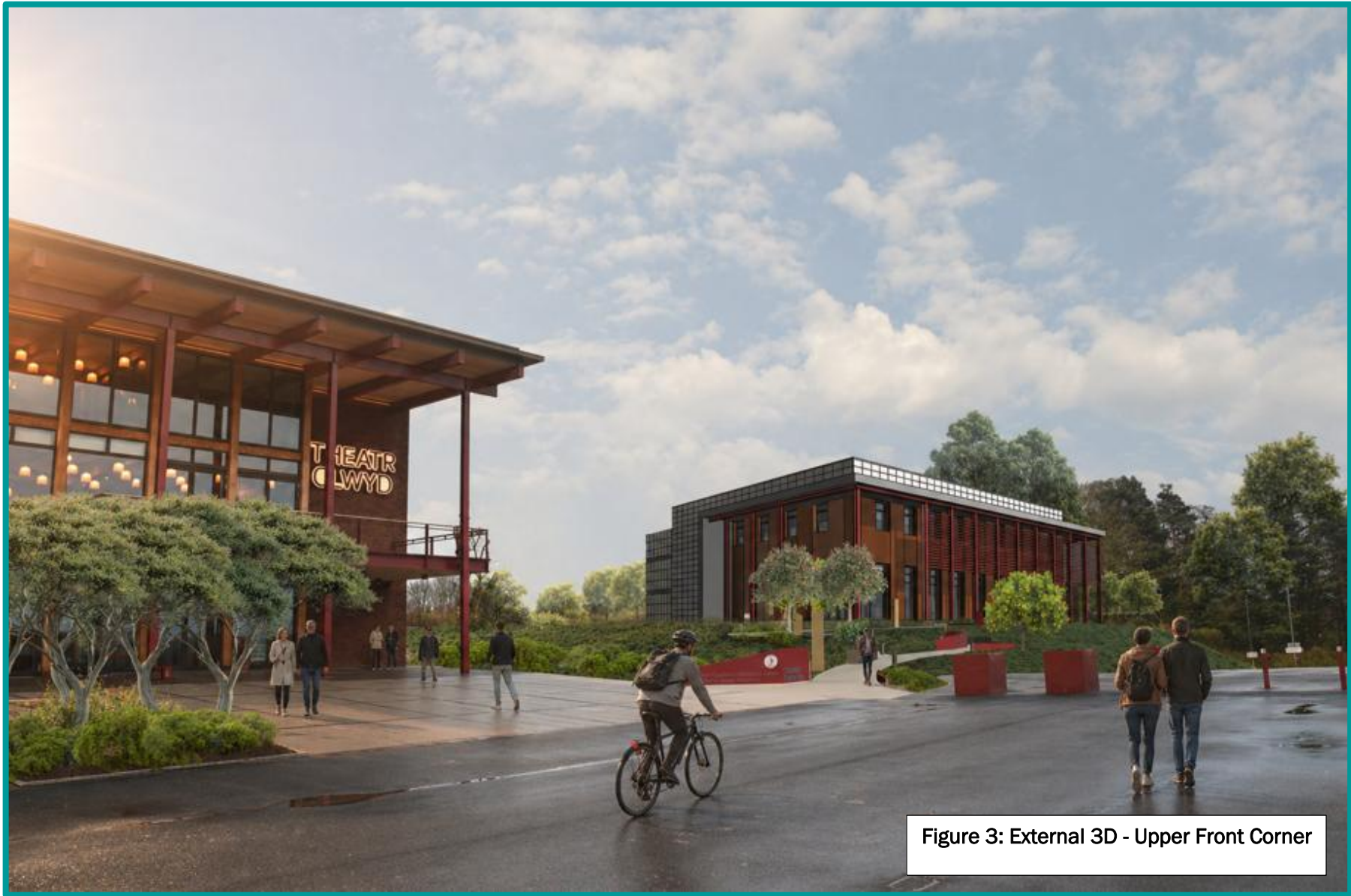
Figure 3: External 3D - Upper Front Corner