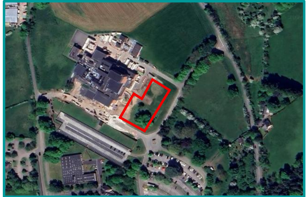
Figure 1: Site location plan (Site in Red)